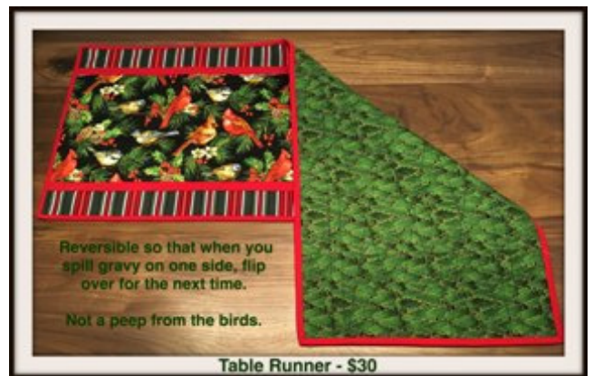
Table Runner - $30