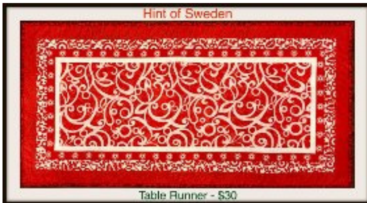
Table Runner - $30