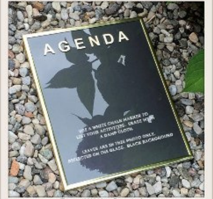
Framed Writing Board - $10