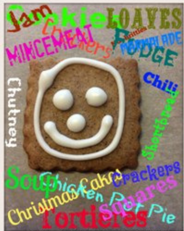
FOOD - SWEET AND SAVOURY