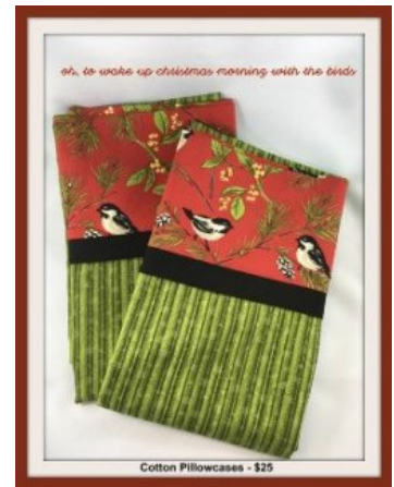
Cotton Pillowcases - $25