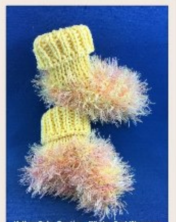
Yellow Baby Booties - Winter Feet Warmers