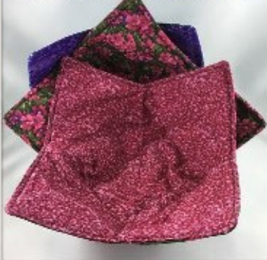
Microwave Bowl Cozy - $8 to $15

Save your hands from burning when taking bowls out of the microwave. It is difficult to hold a hot bowl when slurping soup. You need a pure cotton cozy to keep you safe!