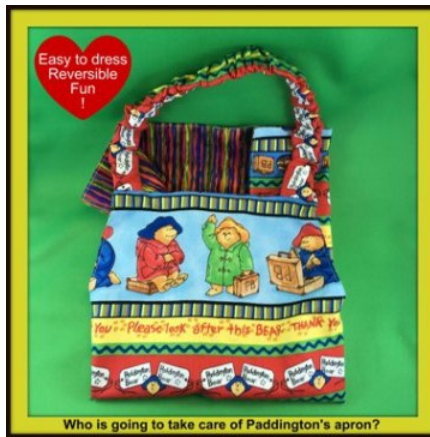
Who is going to take care of Paddington's apron?