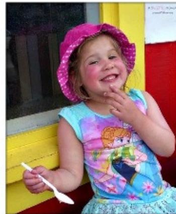
Children's Bucket Hats - Reversible - $20