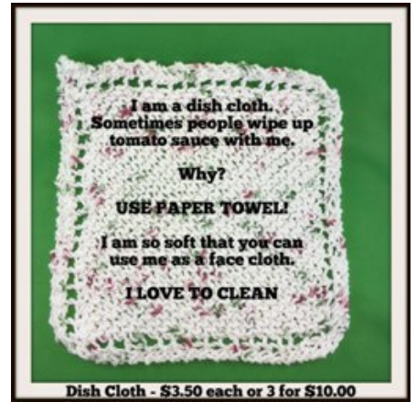
Dish Cloth - $3.50 each or 3 for $10.00