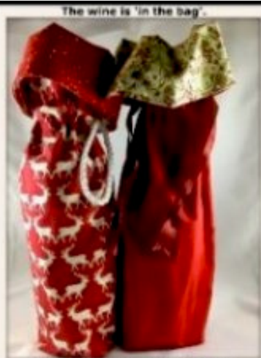
Reversible Wine Bags - $10 ea.

Now, where did I leave my glasses? Is my phone in my purse?