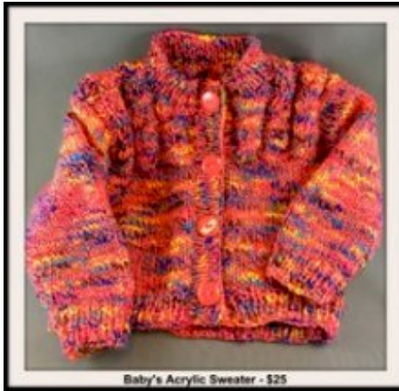
Baby's Acrylic Sweater - $25