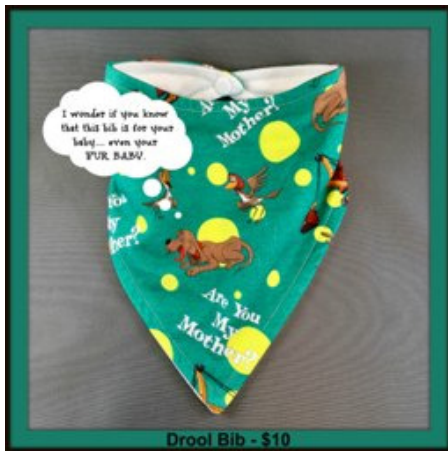
Drool Bib - $10