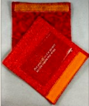
Find Your Luggage Handle Wraps - $5.00 ea