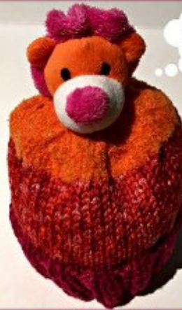
Toddler's Lion Toque